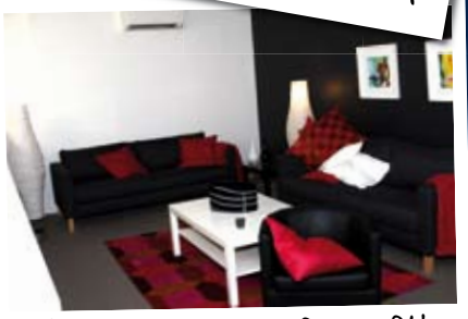
A well deserved facelift!