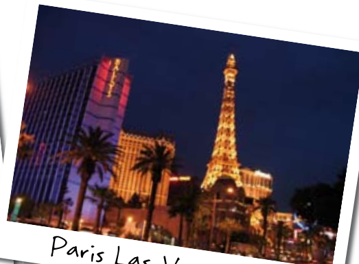
Paris Las Vegas Hotel