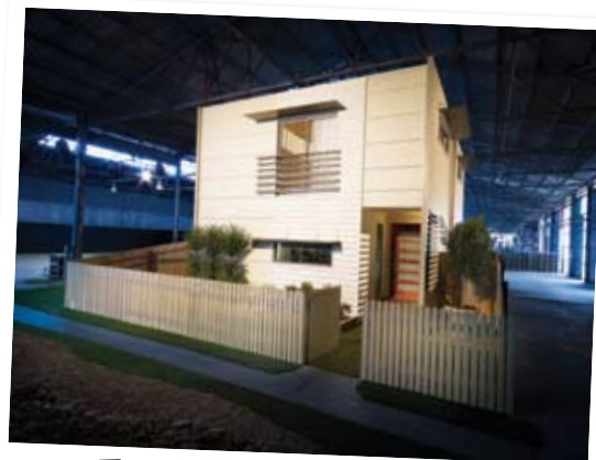
That's Smart thinking!

You can see it at www.smartersmallhome.com.au and book a tour or workshop.