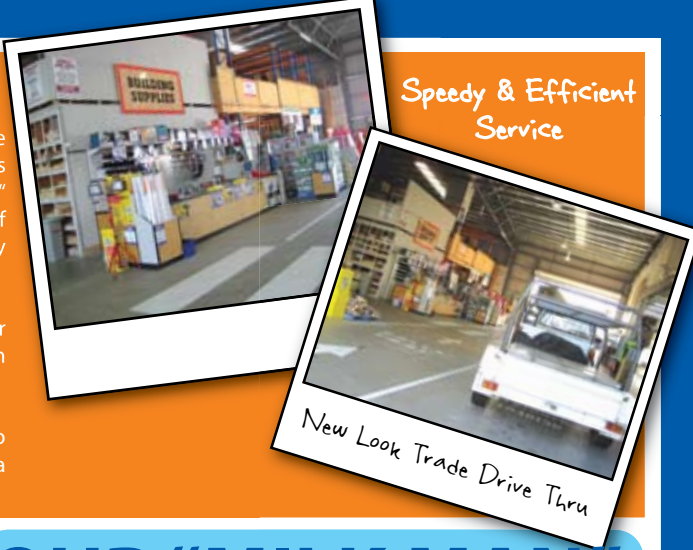
Speedy & Efficient Service