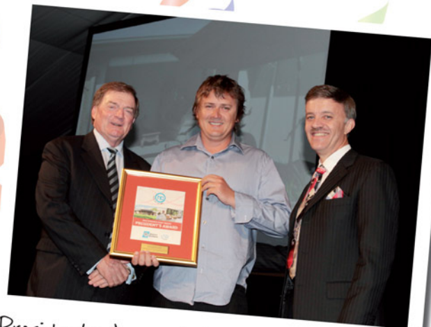
Presidents Award | Coastal Modern Living