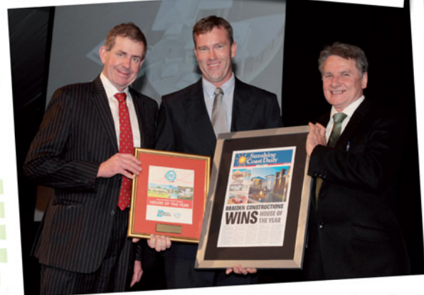
House of the Year | Braeden Constructions