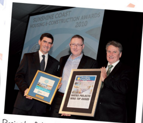
Project of the Year | Matrix Projects