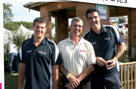
MelcoLanham's Green Thumbs