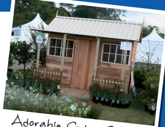
Adorable Cedar Cubbies