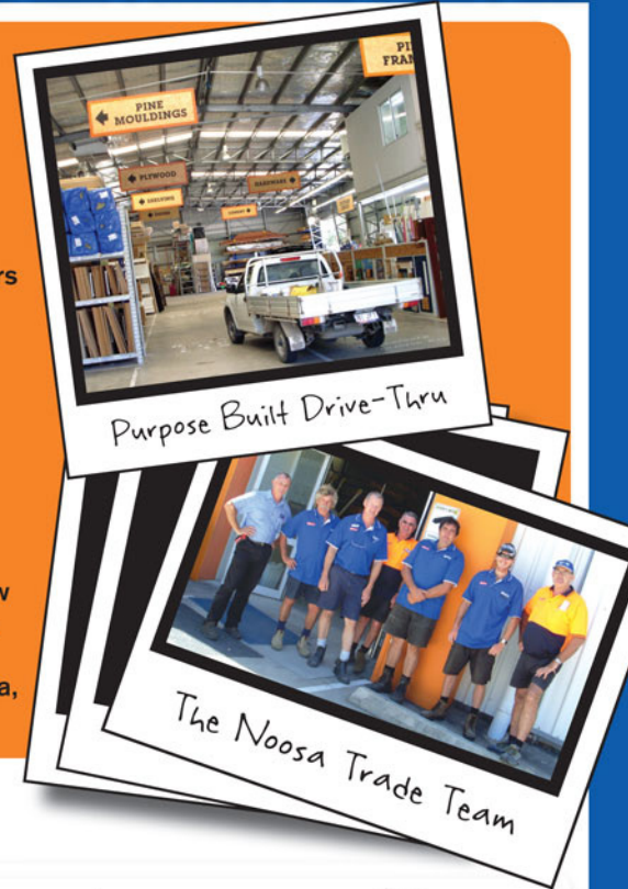
Purpose Built Drive-Thru

So for your next project, call in and see the team at MelcoLanham's Venture Drive Noosa, you won't be disappointed. Ph: 5455 98888 Fax: 5455 9819